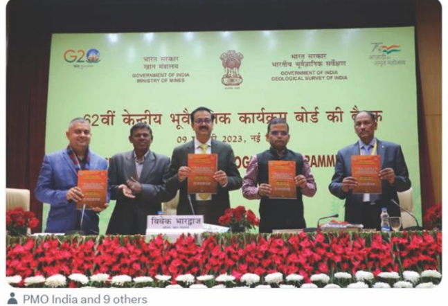
9:59 PM · Feb 9. 2023 · 258.6K Views